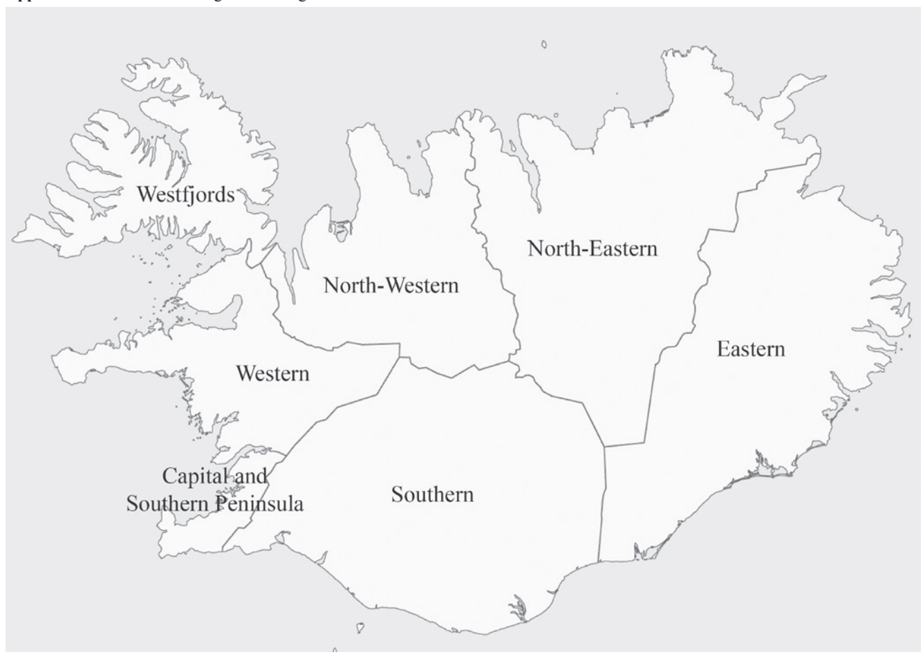
Appendix 1: Main Icelandic regions investigated from 2008 to 2017