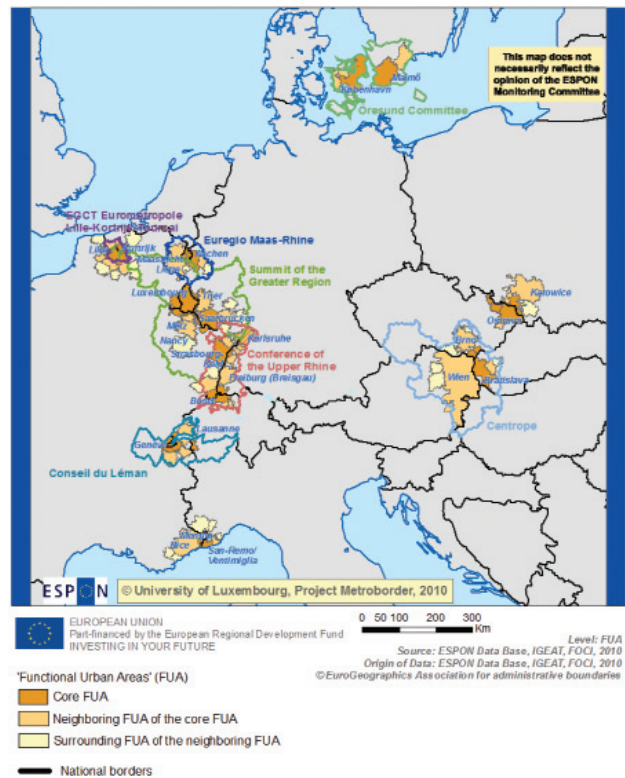
Figure 2: The functional urban areas (FUAs) of the cross-border polycentric metropolitan regions and the cross-border cooperation perimeters.

regional or private funds and better use of existing funds (EC, 2010b). Although the macro-regional strategies have been elaborated by the EC in collaboration with the respective MS and regions, supra-regional bottom-up processes of problem solving and strategy development have been preceded, often in the framework of transnational cooperation projects (Görmar, 2010). Besides the existing macro-regional strategies for the Baltic Sea Region and the Danube Region, further cooperation spaces for potential macro-regional strategies are under discussion e.g. in the North sea Region or the Alpine Region (Figure 1).